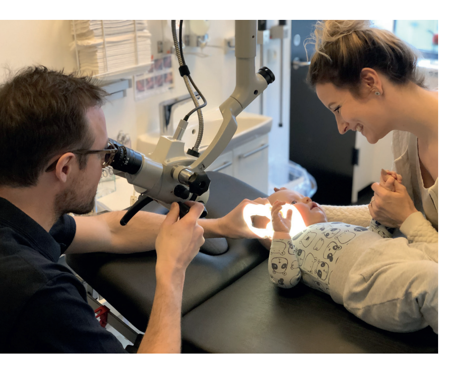
Otomicroscopy of an 8-month-old child performed by an ear- nose & throat specialist.

cally located in all five Danish regions. Inclusion of patients into the database is on-going, and the project can, if needed, prospectively be expanded to all 160 private ear-nose and throat (ENT) specialists in Denmark. The present study reports on the results from the first 3,553 patients enrolled from March 2017 to August 2018.